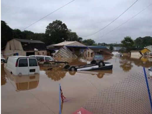
2009 flooding outside Atlanta.